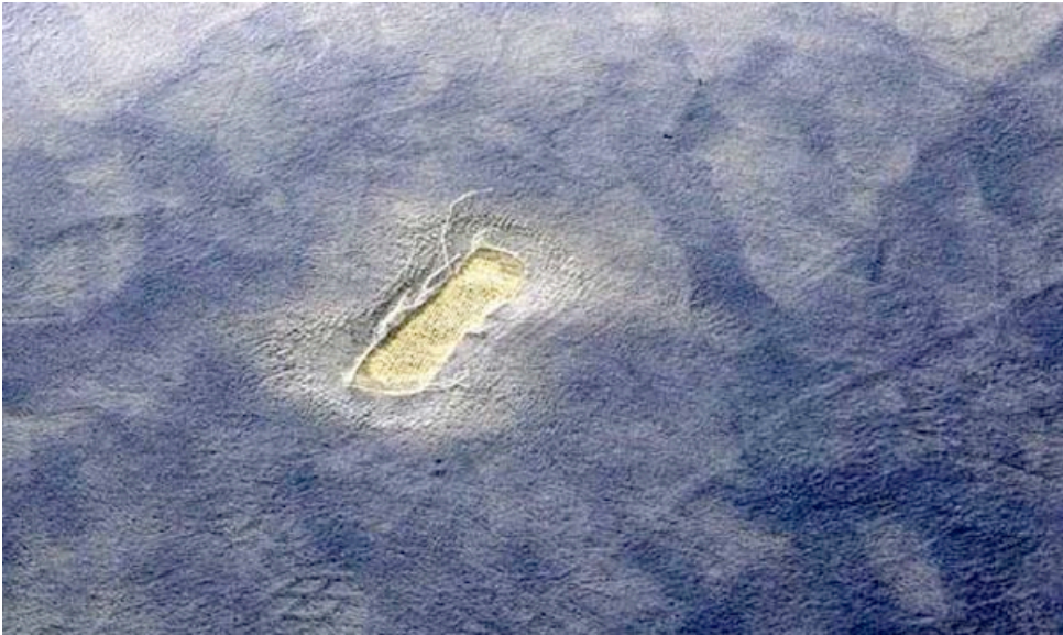
Mesmo Aqui (Right Here), 2000