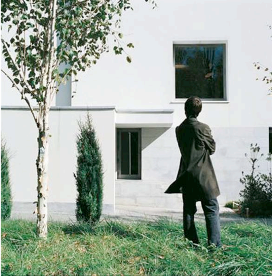
Another Smoker, 2004