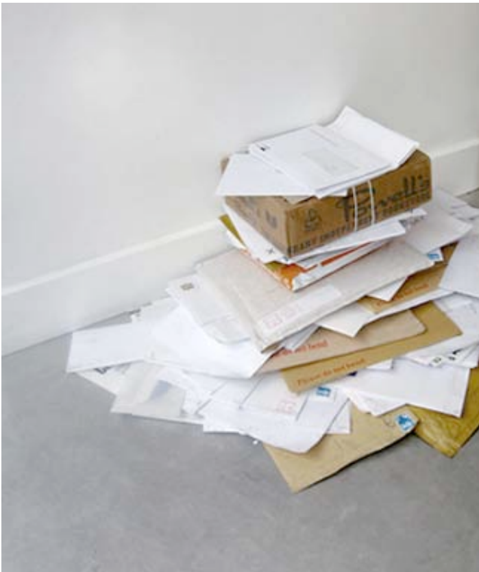
All The Best, 2008 All mail sent to the gallery during the exhibition remains unopened