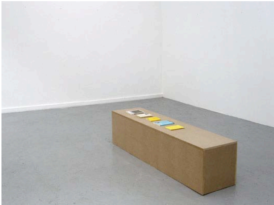
Event, 6 books, 6 men, from 'Permanent Collection', 2009

Following only their memory, the gallery staff has been asked to excavate all the filled holes in the walls made from hanging the artwork in previous exhibitions in the space