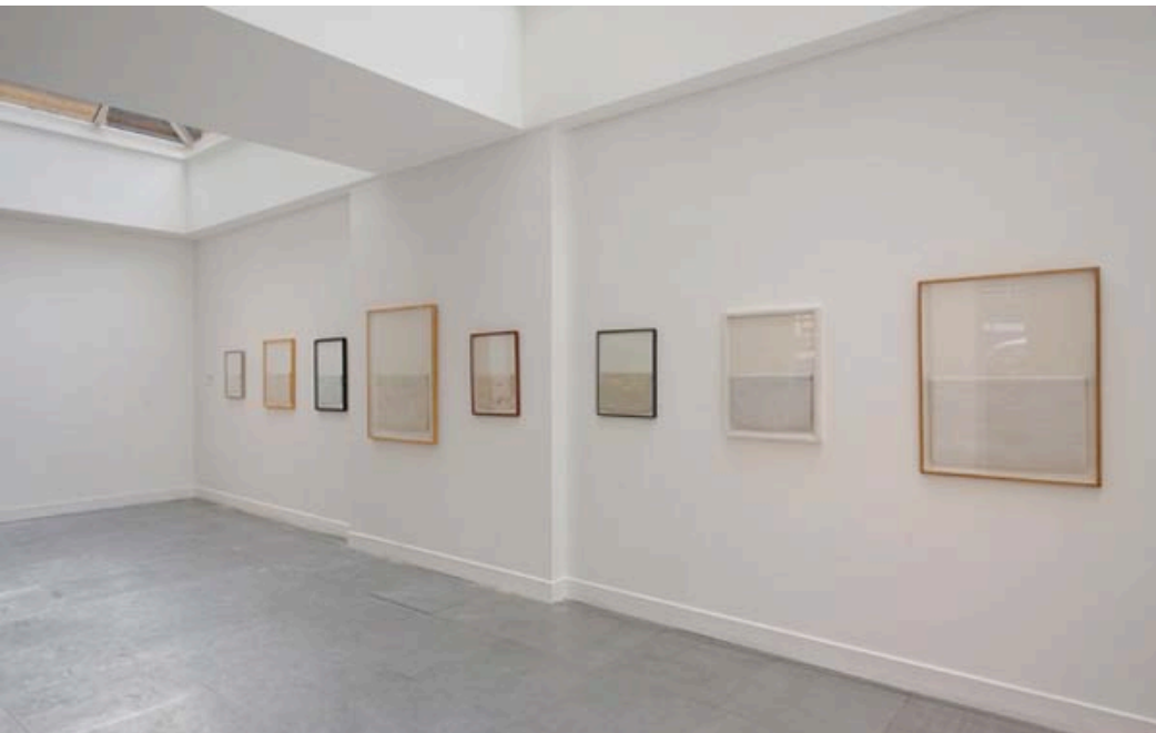
The Archives , 2008 Second hand peace posters folded, various sizes