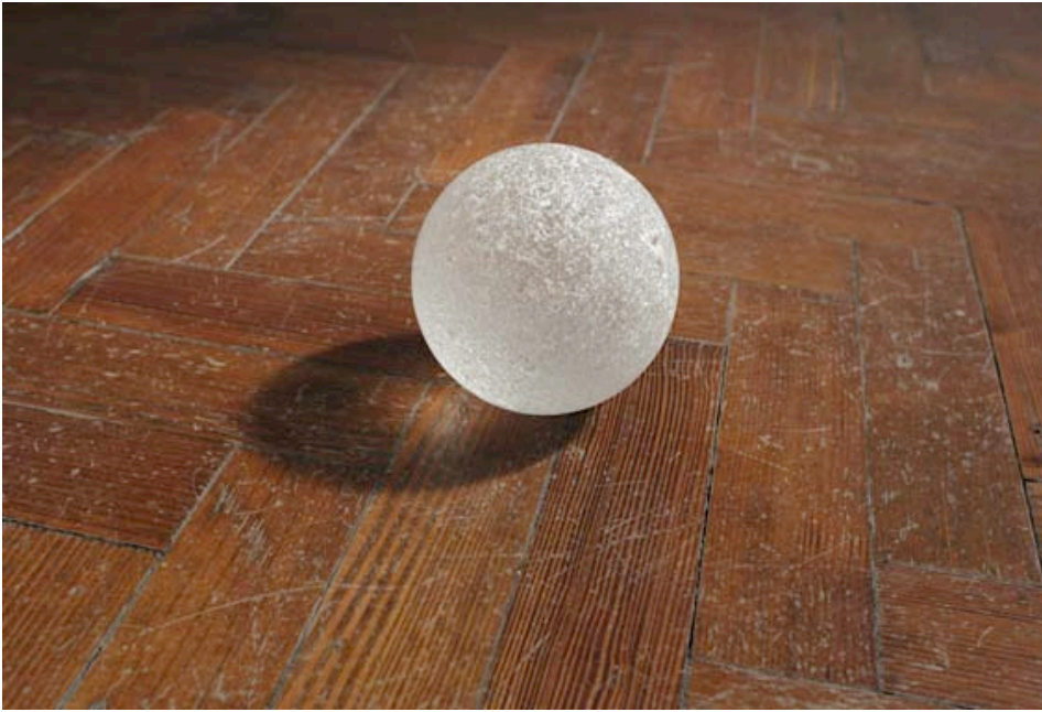
History Makes a Young Man Old, 2008 Crystal ball rolled to its destination, 10 cm in diameter