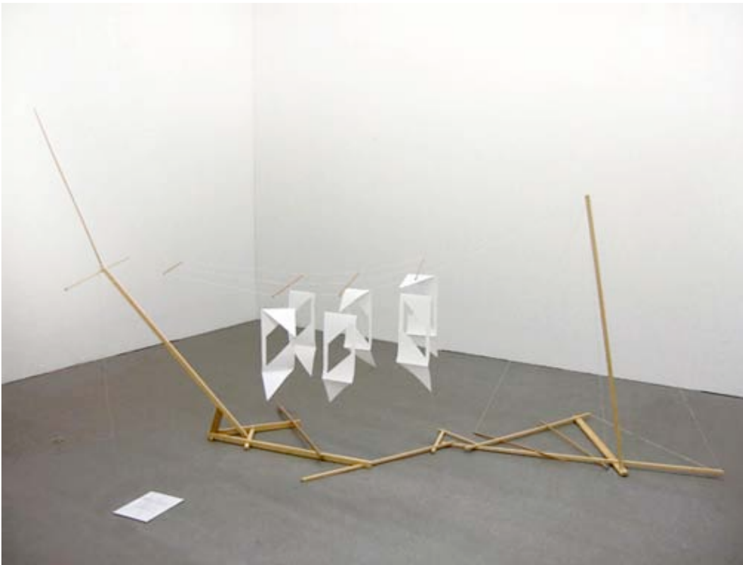
Raising Dante's Rig , 2009 Wood, paper, string