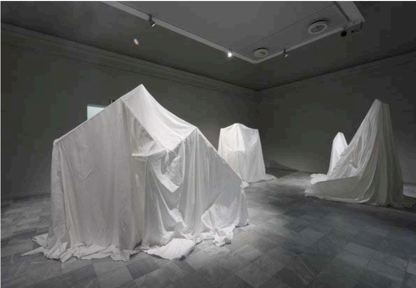
"After Walking on Grass as Crisp as Glass and Breathing Solid Air, Ghosts of Bronze and Sculptured Stone", 2008 installation view, T2 Triennial, "50 Moons of Saturn", Turin