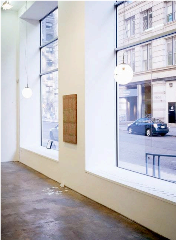
"Two Lamps Collide (inadudible, phone rings, truck drives by)", 2010 2 glass and steel lamps