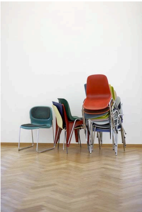
"Years of Progress (stacked)", 2006 exhibition view "Like Origami Gone Wrong", 2007, Kunstmuseum Thun